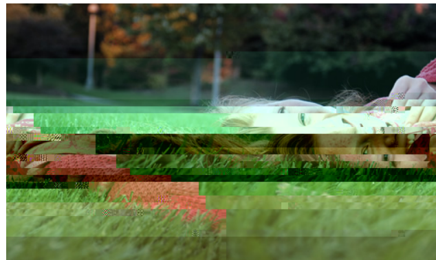
"Girl on the Green, Fall"