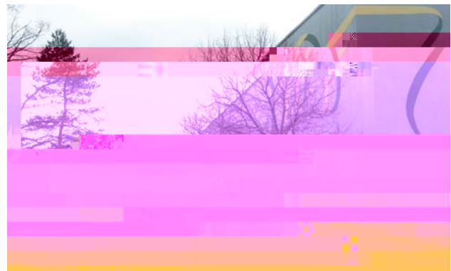
Dance and Sports Centers